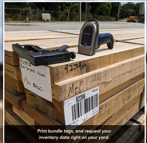
Print bundle tags, and request your inventory data right on your yard.