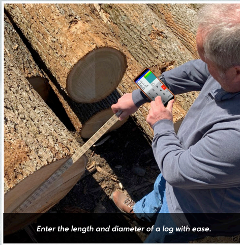
Enter the length and diameter of a log with ease.