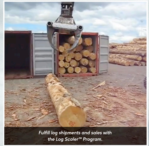
Fulfill log shipments and sales with the Log Scaler™ Program.