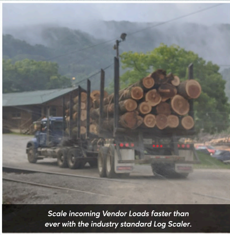
Scale incoming Vendor Loads faster than ever with the industry standard Log Scaler.